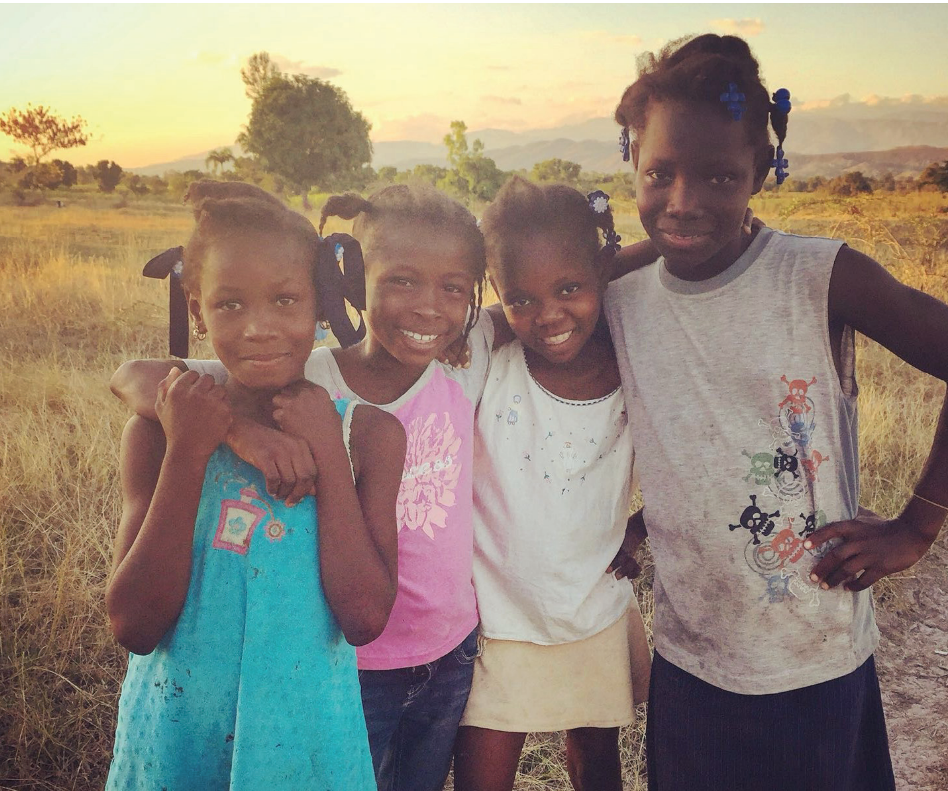
Malnutrition and routine pediatric diseases like diarrhea are a major cause of mortality and disability in children under five years of age.