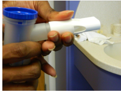
2. Put mouthpiece on the nebulizer container.