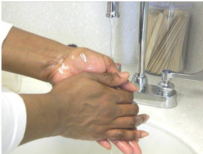
1. Wash hands.

A nebulizer uses a machine that makes a mist of medicine to breathe in through a mouthpiece or face mask. Your child's doctor or nurse will tell you how much medicine to put into the nebulizer. Follow the steps below on how to use a nebulizer with a mouthpiece.