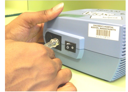
4. Attach other end of tubing to nebulizer machine.