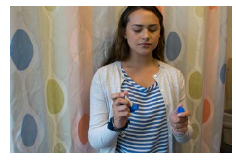
Take off cap from the inhaler.