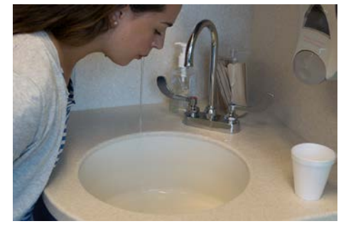
10 Rinse mouth with water. Spit.

If your dose is 2 puffs, repeat steps 4-8.