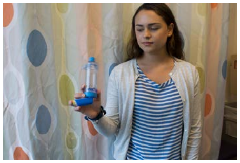
Shake the inhaler and spacer to mix up