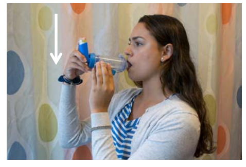
Press down on the inhaler to put 1 puff of medicine into the chamber. Breathe in slowly and deeply. If spacer makes a whistling noise, breathe more slowly.