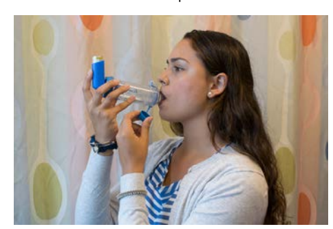
Put the spacer mouthpiece in your mouth and form a tight seal.