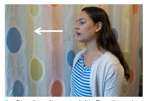
Stand or sit up straight. Breathe out