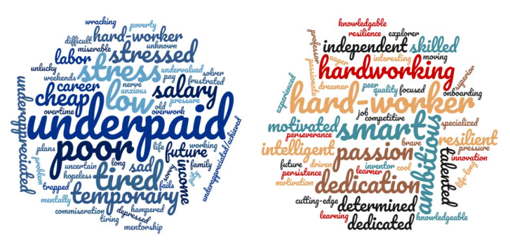
Figure 2. Submissions grouped by negative (left) or positive (right) connotations. Neutral words were not included.