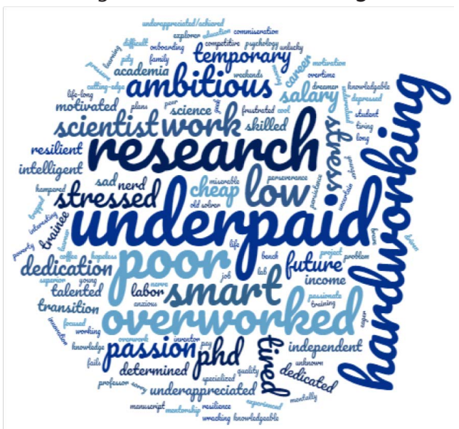
Figure 1. Summary of responses. Word clouds show the variety of responses with text size in proportion to their frequency.

In July 2019, the BCH postdoc association (PDA) Public Affairs committee was interested to know what it is like to be a postdoc? We asked the Boston Children's research community to define how they perceived postdocs with only three words. 76 people, the majority of which were postdocs (85%), answered our survey. We combined their answers to generate word clouds ( Figure 1 ).