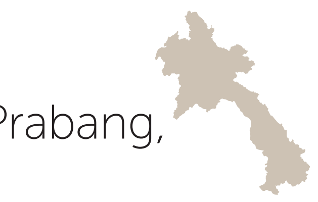
Laos has two pediatric hospitals responsible for providing care for more than 2.8 million children.

Help Us Grow: This partnership is dedicated to developing a successful pediatric care system through clinical quality and education while targeting the unique health needs of the region. This collaboration could be expanded to formal training programs and additional diseases could be supported through this unique clinic model — both at LFHC and at other sites around the world.