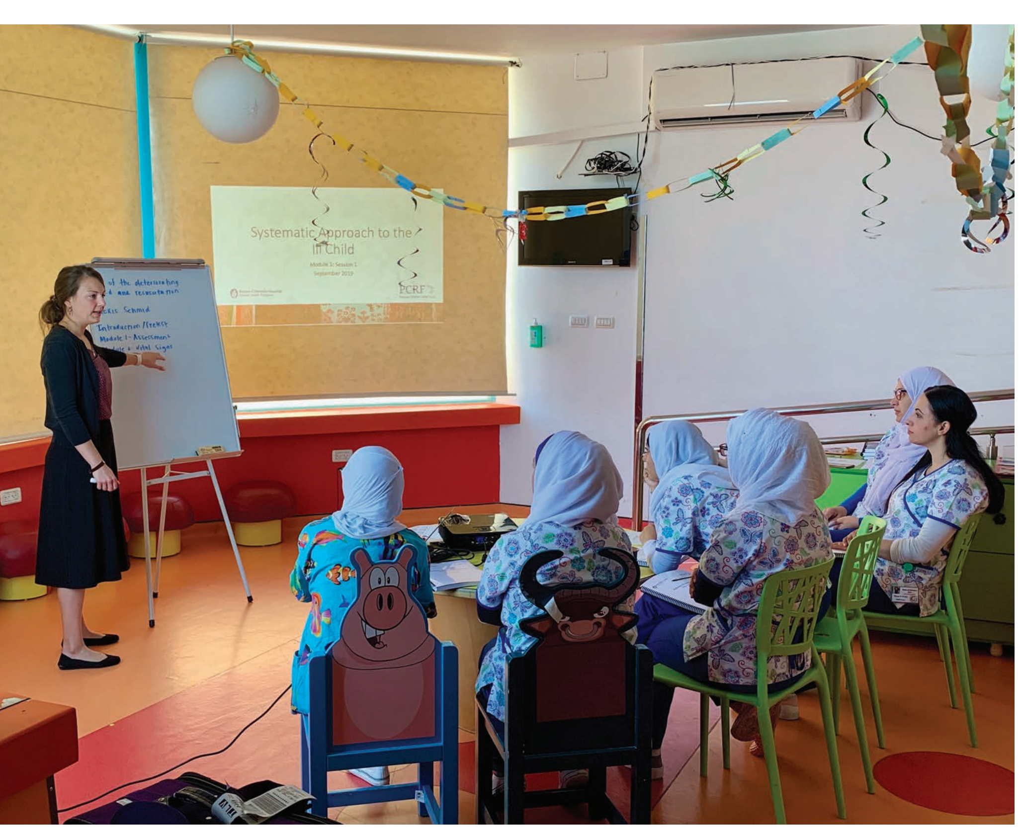
2.5 million children currently live in the Palestinian territories. Over 1 million of these children have urgent humanitarian needs, but safe and timely access to pediatric care is limited.