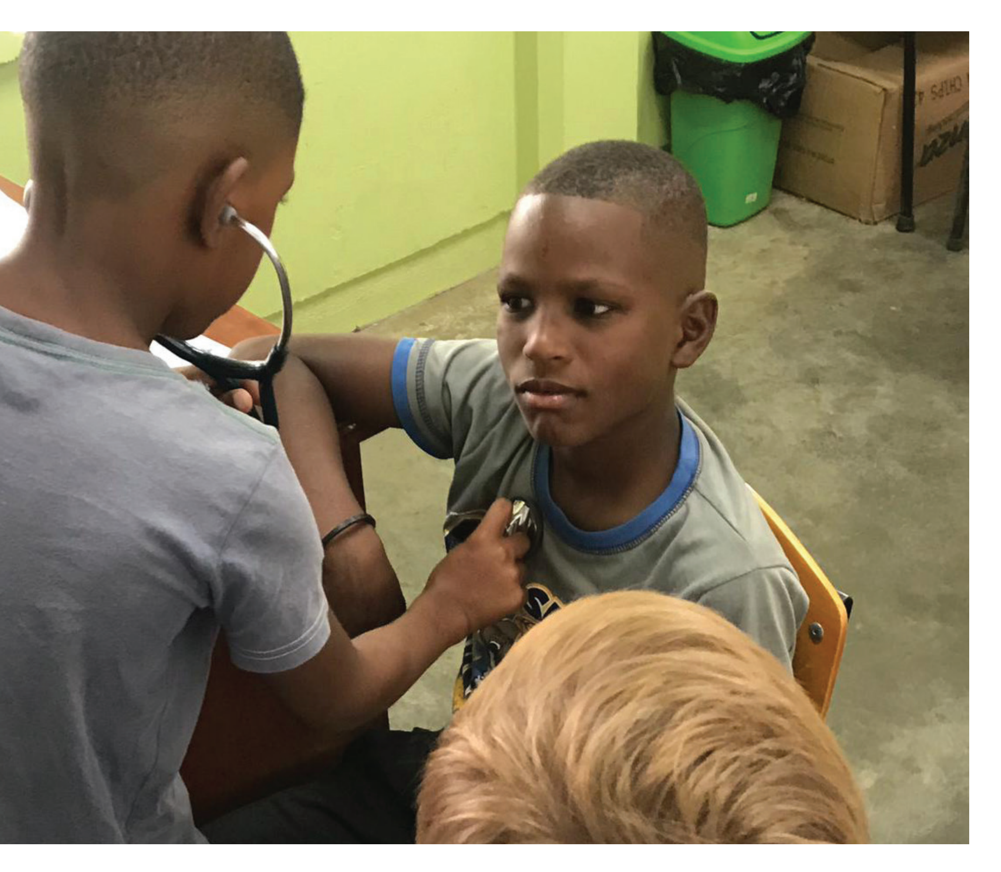
There is very little primary literature about excess mortality for children and adults with chronic non-communicable diseases in humanitarian settings.