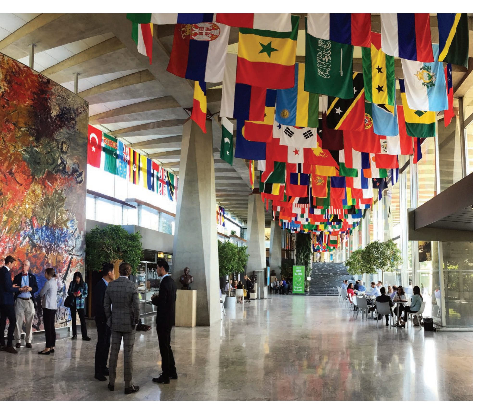
In May 2015, the PGSSC team began working with then Zambian Ministry of Health (MOH) to improve surgical care in Zambia.