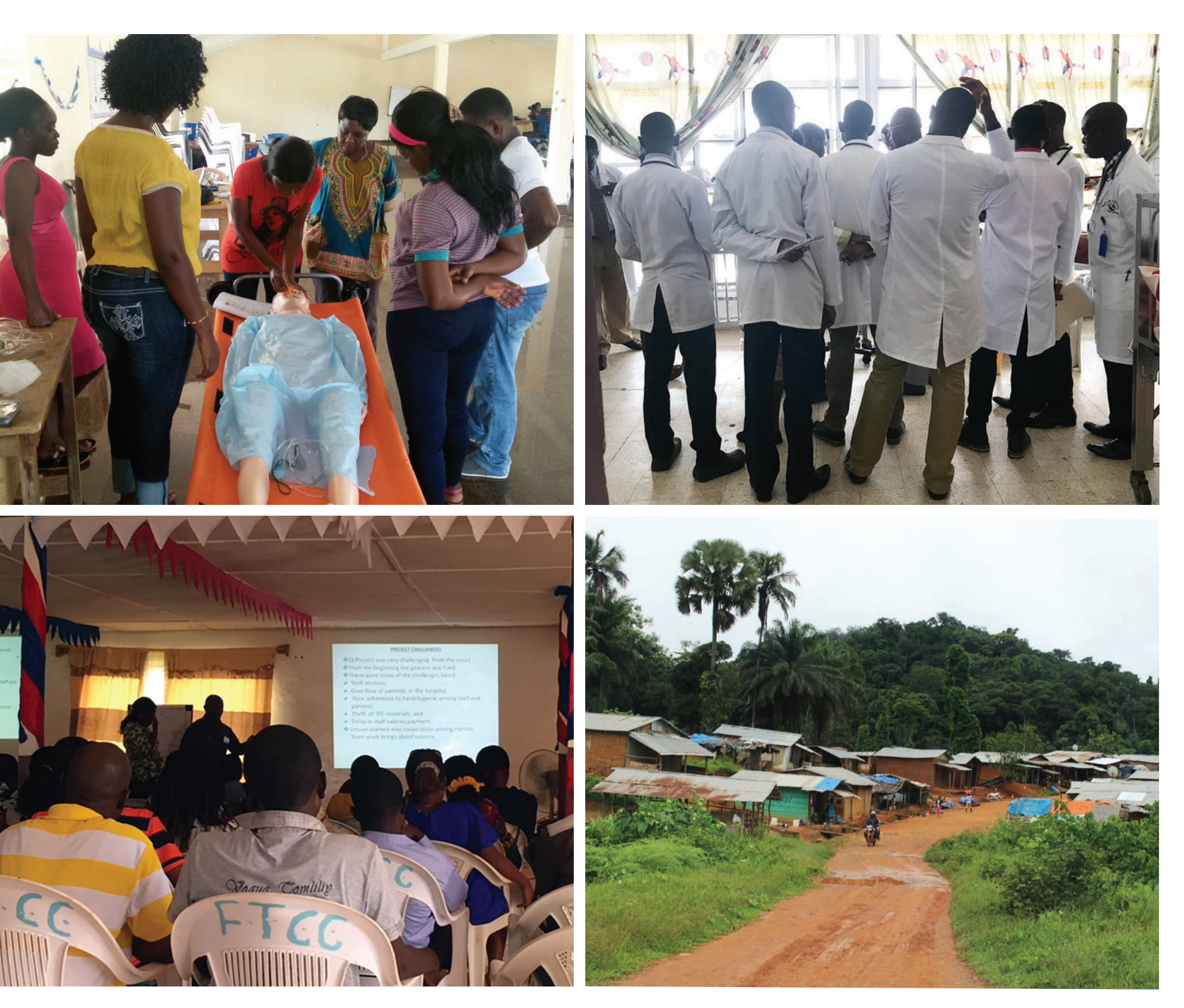
Liberia is severely understaffed in pediatric medical and nursing care. Currently, the country has over two million children and only 11 pediatricians.