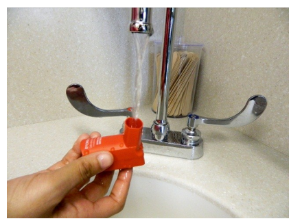
5. Turn the plastic inhaler cover upside down and run that end under warm water for 30 seconds.