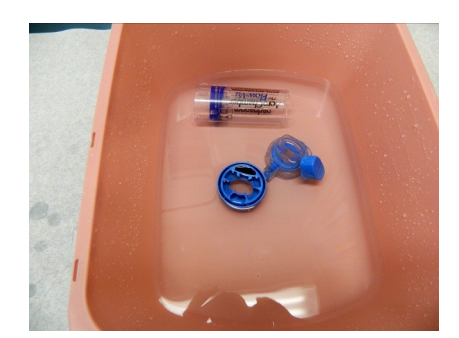
5. Rinse spacer parts in clean water.