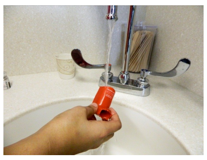
4. Hold one end of the plastic inhaler cover under warm water for 30 seconds.