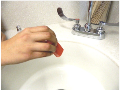
7. Shake off any water on the inhaler cover.