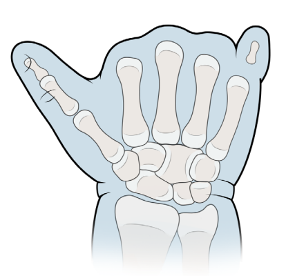
There is only the thumb or the thumb and little finger.