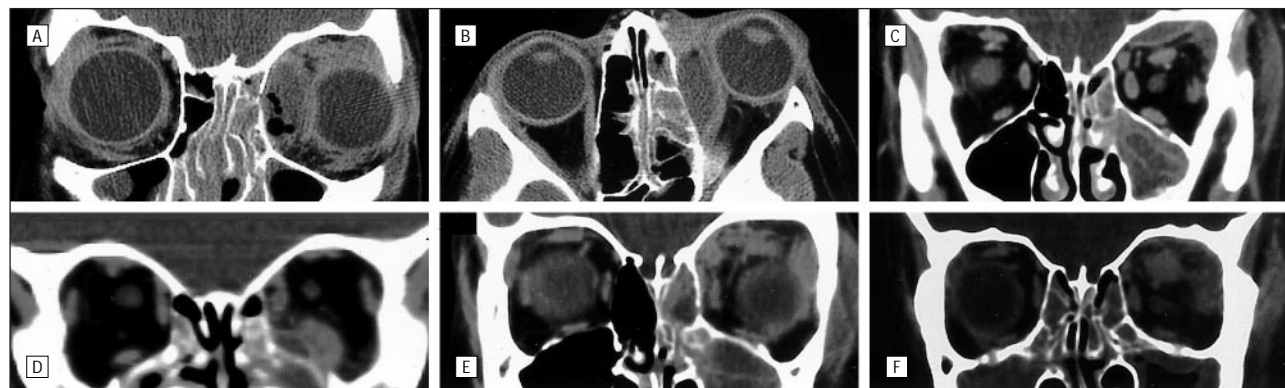
Figure 1. A, Coronal view of a medial SPA. B, Axial view of a medial SPA. C, Coronal view of a superior SPA. D, Coronal view of an inferior-medial SPA. E and F, Orbital fat and muscle enhancement. SPA indicates subperiosteal abscess.

‡This patient experienced dilation of retinal vessels.