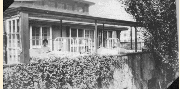
Patients on sun porch, Boston Children's Hospital, 1920.