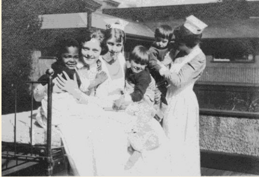
Nurses and patients on ward 5 lower sun porch, Boston Children's Hospital, 1920

Fresh air and sunshine were so widely considered essential treatment for disease in the 19th and early 20th centuries that hospital ward design, including Boston Children's, incorporated open air spaces, like these sun porches.