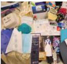
A few items in the new Time Capsule